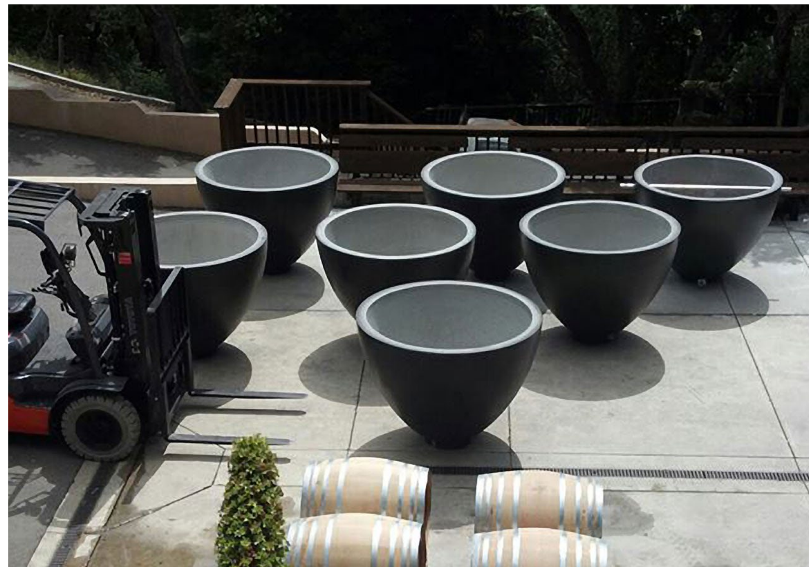
CONCRETE TEACUP | 274 GAL